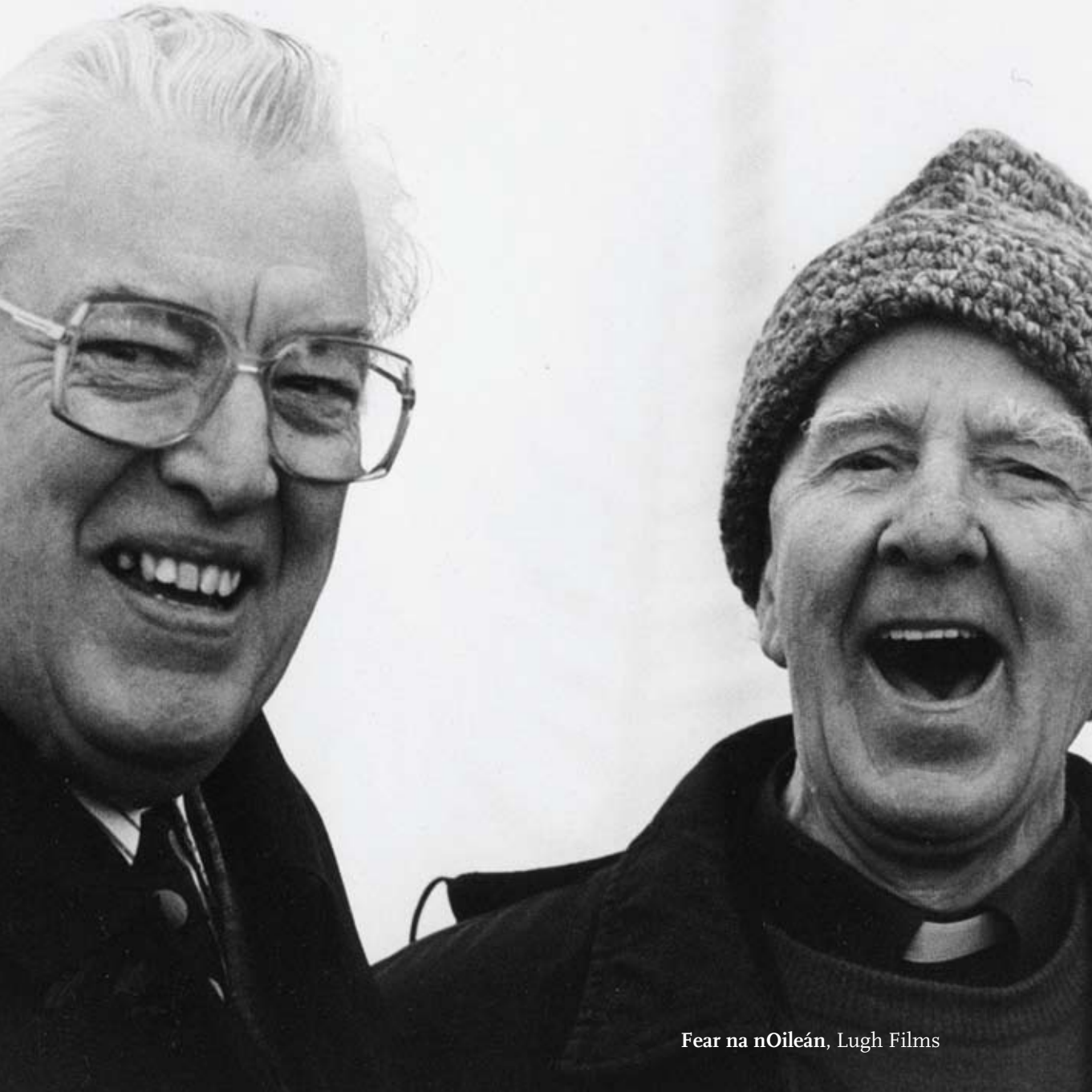
Fear na nOileán, Lugh Films