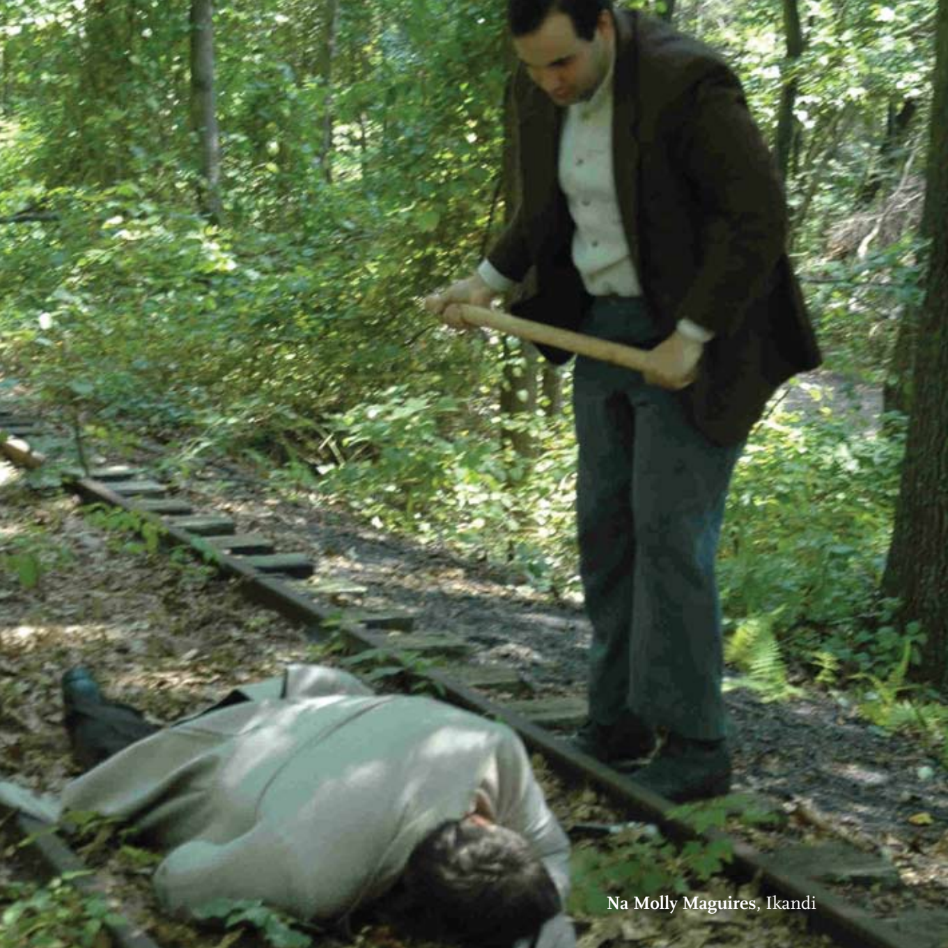
Na Molly Maguires, Ikandi