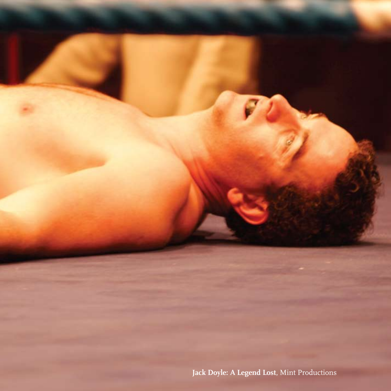
Jack Doyle: A Legend Lost